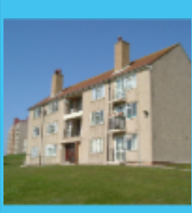
Brighton and Hove