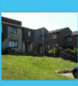
Brighton and Hove