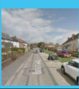
Brighton and Hove